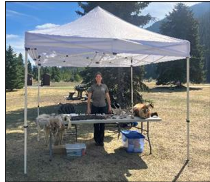
Kite Festival, Manning Provincial Park

and a game to match tracks to the appropriate pelt/skull/antlers/etc. The table was very popular, with approximately 627 people stopping by over the three events. This led to some good conversations about species at risk in the North Cascades, Skagit Valley Provincial Park, “nature knows no borders,” and the effects of climate change.