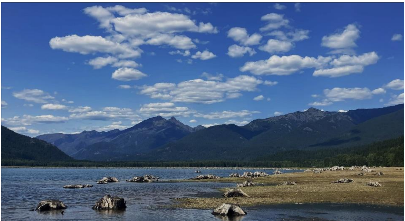
Shawatum Mountain, July 2023

It's anticipated that the Silver Skagit Road will be open to public traffic during the 2024 camping season. This would allow for the IIP to return to regular programming (and the chance to finally use the new interpretation shelter!). However, if recent years have shown anything, it's that nothing is certain. The IIP will attempt to provide the best interpretive experiences possible with whatever situation unfolds next season and in future years.