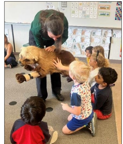
AJ visiting Little Mountain Elementary School