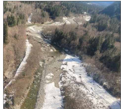
Silver Creek cutting across Silver Skagit Road, March 2022